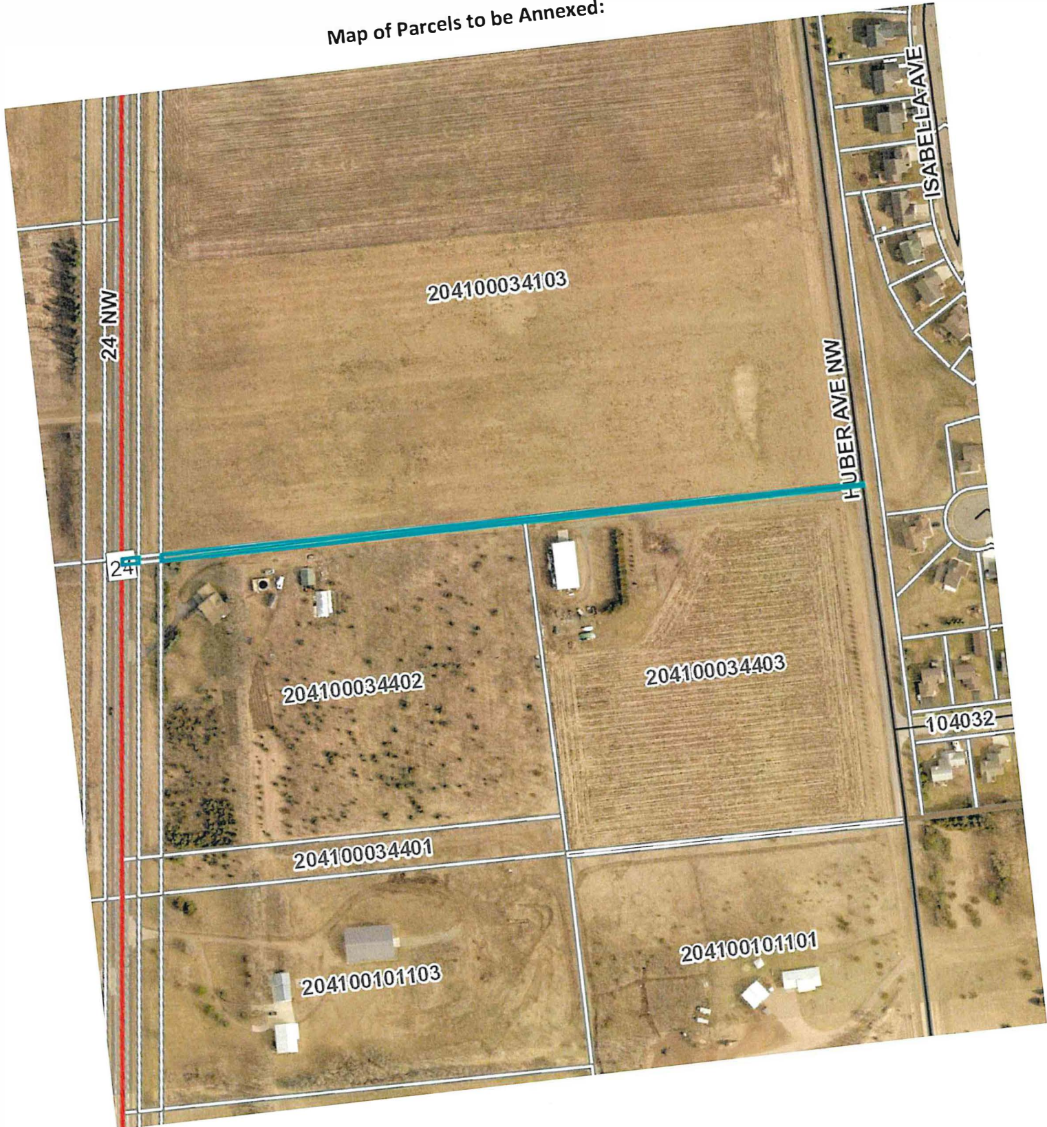
Map of Parcels to be Annexed: