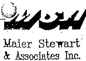
EXHIBIT B RIGHT OF WAY & PROPOSED ANNEXATION TO CITY OF ROCKFORD