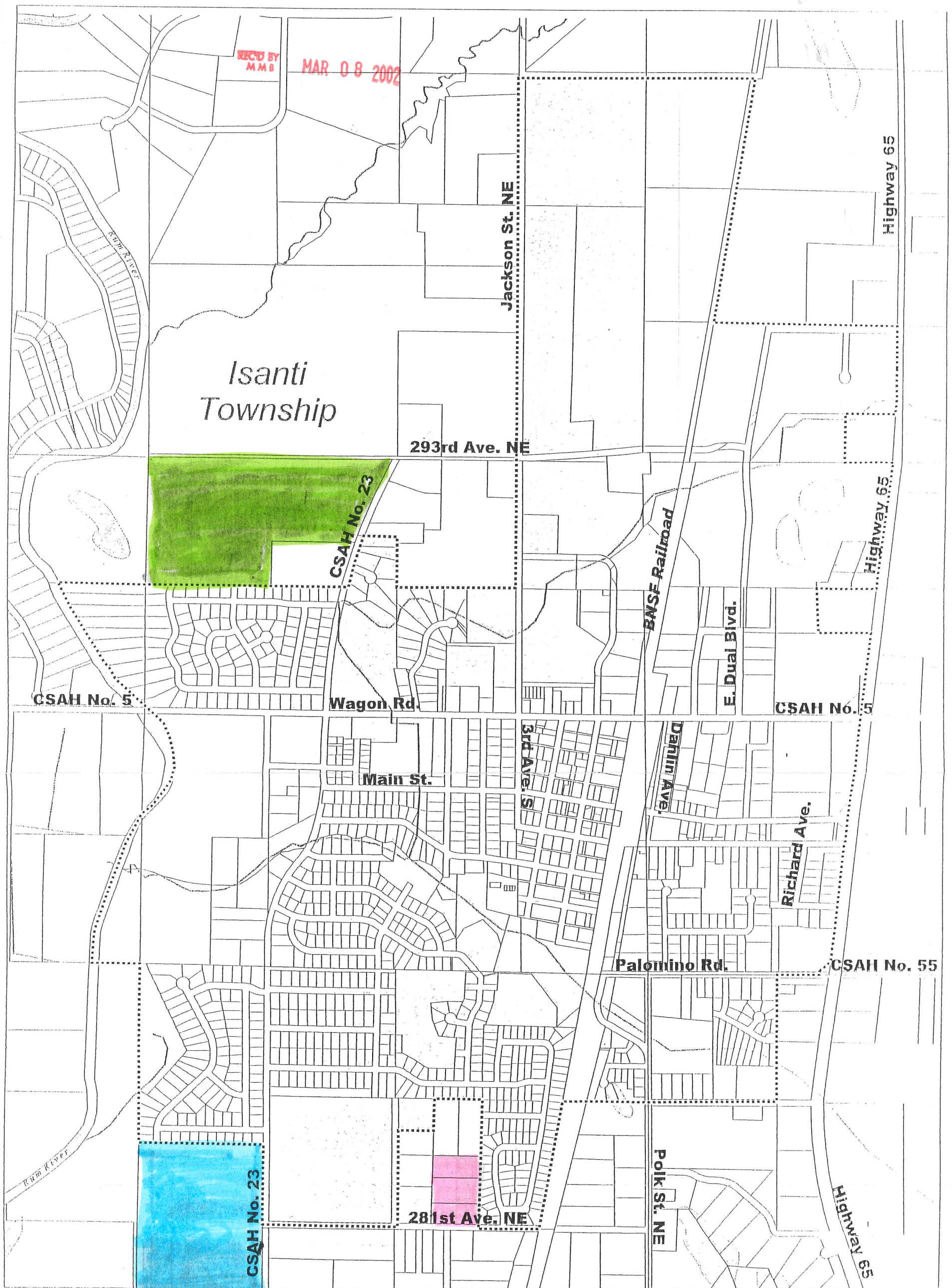
Figure 2. Community Base Map Isanti, Minnesota