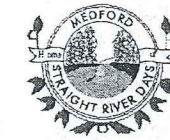
EXHIBIT "A" Tables